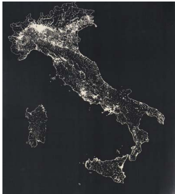
satellite photo. Italy, lightscapes

the 20 architects here presented work out from different cultural places and positions, sometime quite opposite, but we identify them in any case as Italian architects. Why?