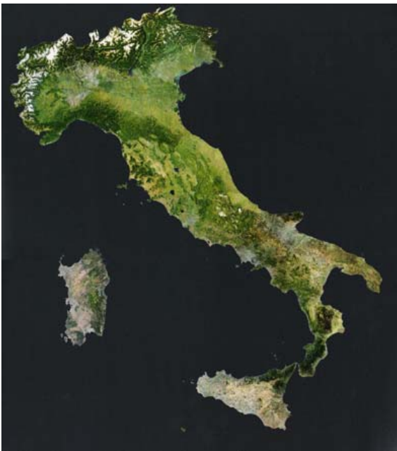
satellite photo. Italy, landscapes

The objective of this issue of WA is to stimulate and increase awareness on several points of view that are emerging in Italy today, confronting the specifics and similarities of practicing architecture, here and elsewhere, in the open dynamic of the geographical and cultural exchange. It's not an instantaneous shot of Italy today but, rather, a shared report of what is happening there.