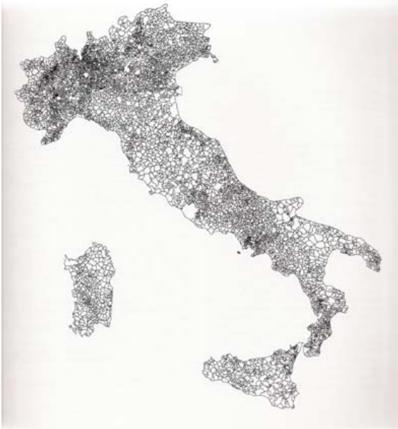
Italy. 8.100 Commons