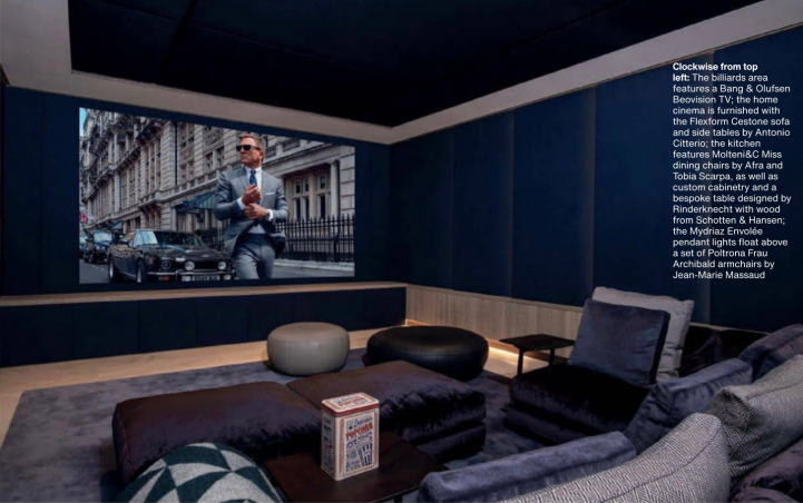
Clockwise from top left: The billiards area features a Biang & Olufsen Boovision TV; the home cinema is furnished with the Platform Casolare sofa and side tables by Antonio Citterio; the kitchen features Molteni&C Miss dining chairs by Afra and Tobia Scarpa, as well as custom cabinetry and a breakfast table designed by Rinderknecht with wood from Schotten & Hansen; the Myriad Envois pendant lights float above side of Potrona Frau Archibad sanctuaries by Jean-Marie Massaud